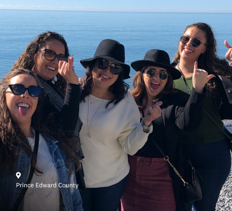
Prince Edward County