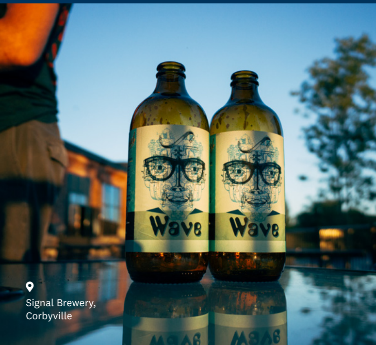
Signal Brewery, Corbyville