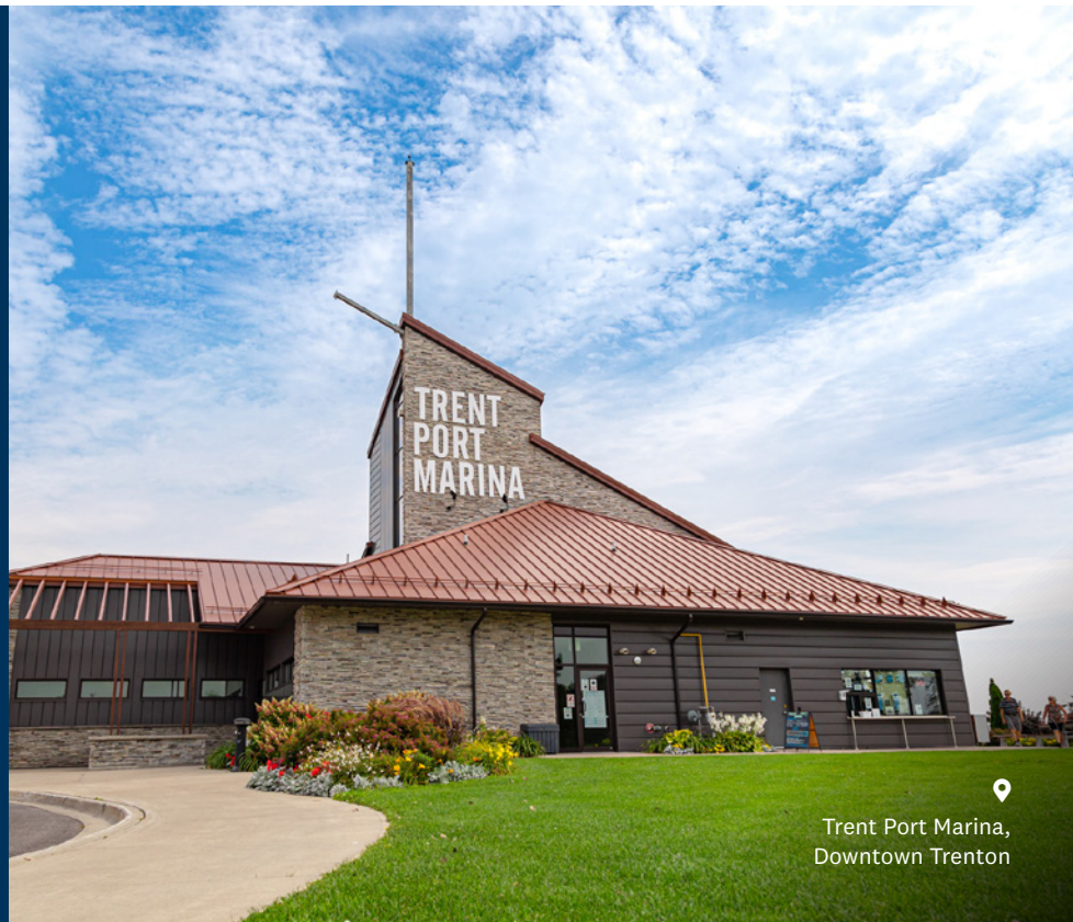
Trent Port Marina, Downtown Trenton

Bay of Quinte – West – Cycling Itinerary