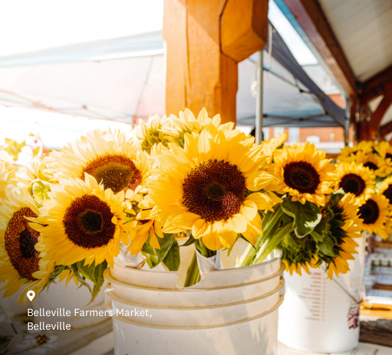
Belleville Farmers Market, Belleville