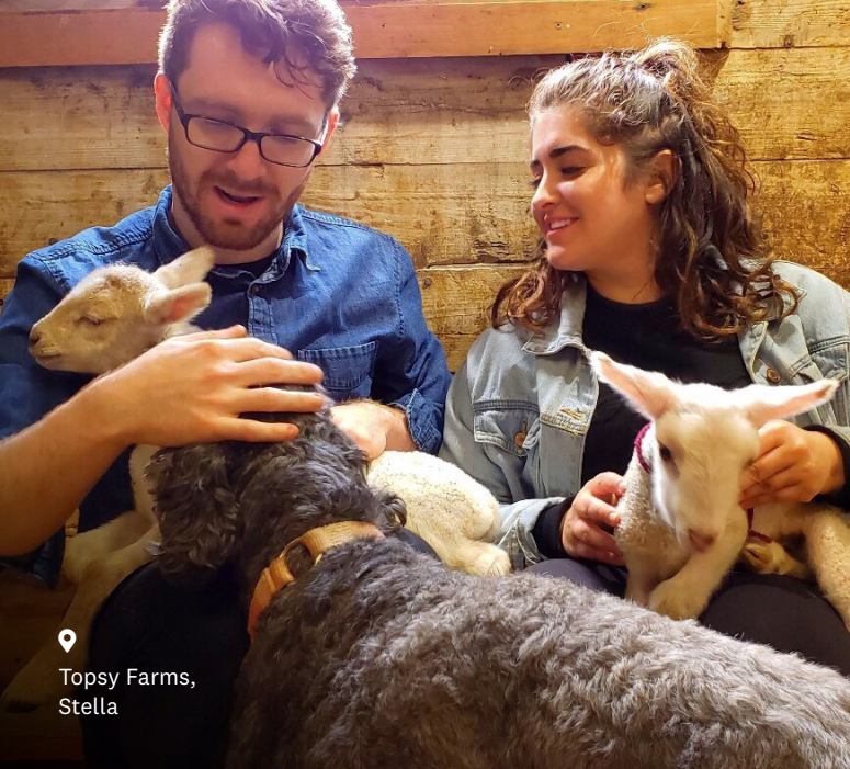
Topsy Farms, Stella