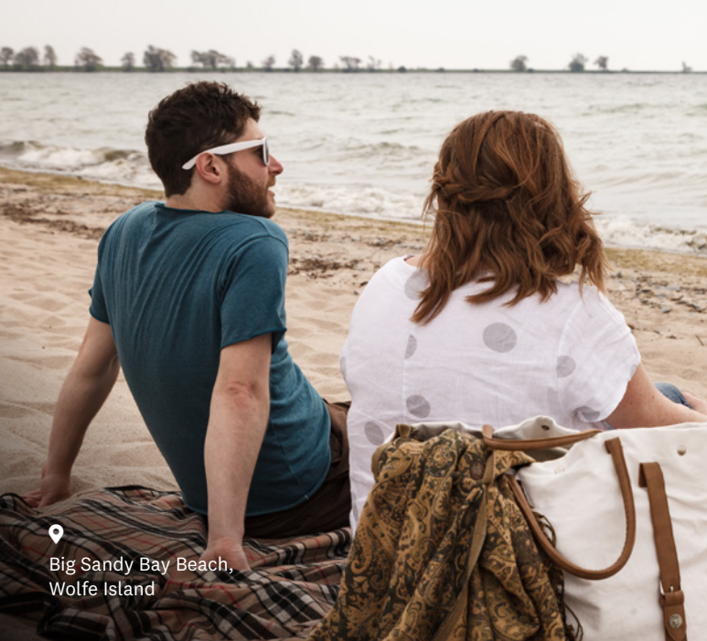
Big Sandy Bay Beach, Wolfe Island