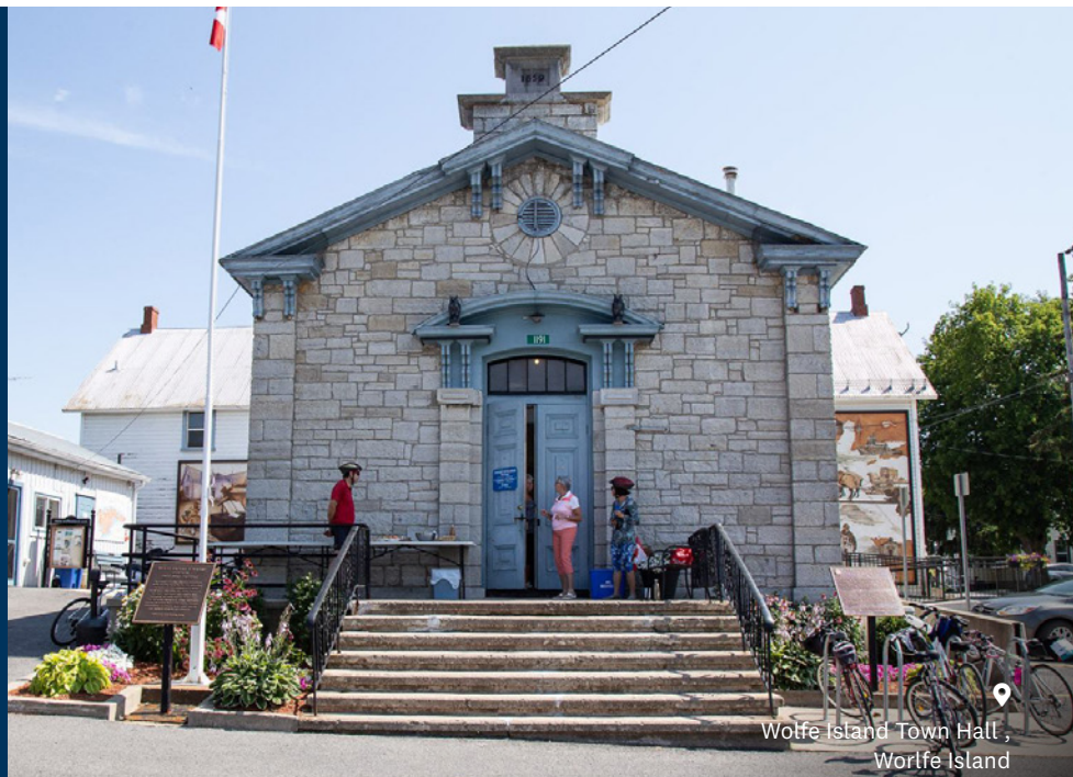
Wolfe Island Town Hall, Wolfe Island

Wolfe Island (Seasonal Ferry) - Cycling Itinerary