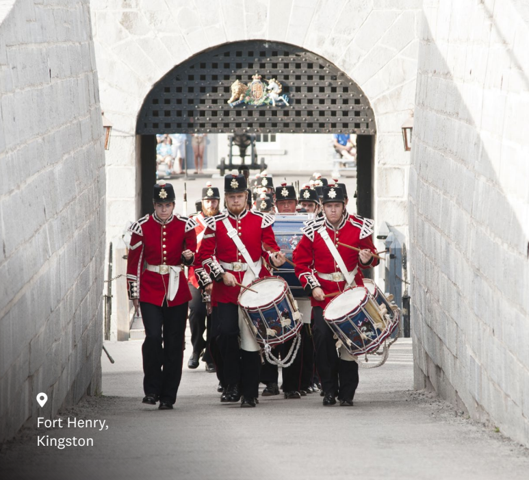
Fort Henry, Kingston